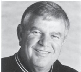
Spike Dykes 2013