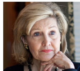
U.S. Senator Kay Bailey Hutchison 2006