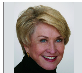
Sculptor Glenna Goodacre 2001