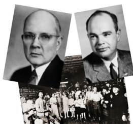
United Supermarkets 2003