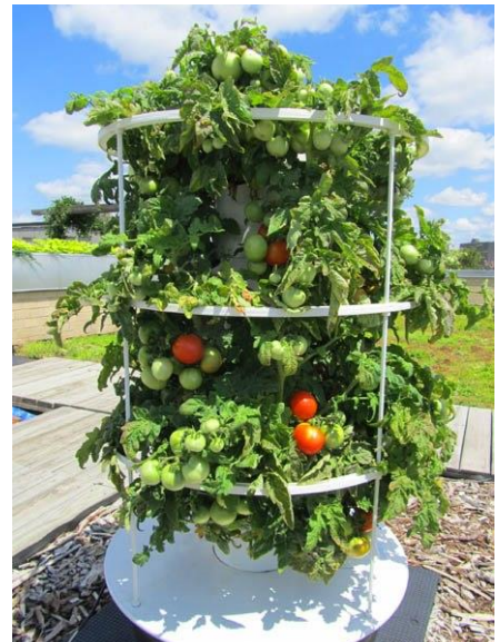
An example of a vertical aeroponic tower